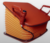
Power Lift Cushion