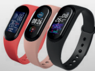
Blood Pressure Monitor